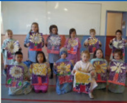
Image: Students in our Year 6/7/8/9 School Holiday Workshop.