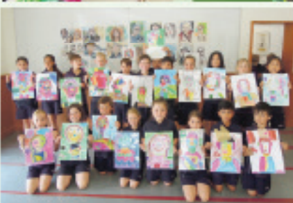
Image: Year 6/7/8/9 students from our Top Art Drawing Workshop.

A minimum of 2 weeks' notice is required for a guided tour or workshop.