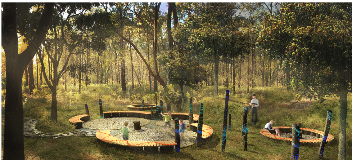
OUTDOOR LEARNING AREA alex urena design studio © 2019

The MOST votes win the funding, it's up to YOU!